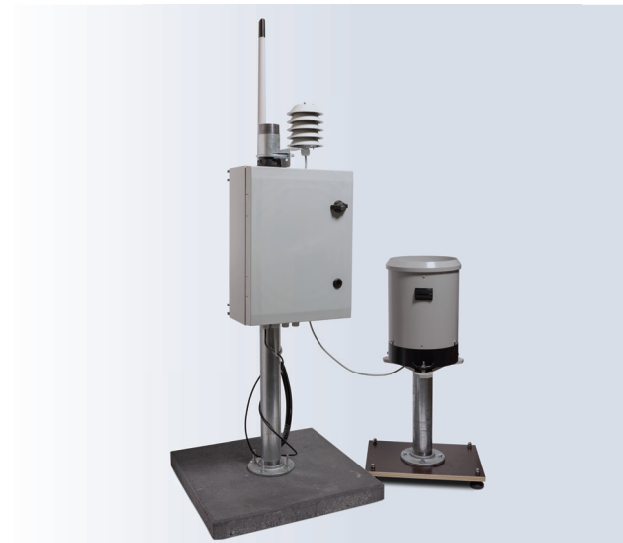
Sample Illustration: iBOX-EU with TB4, external antenna and air temperature sensor